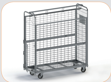
NESTABLE FRONT PANEL OPTION 1